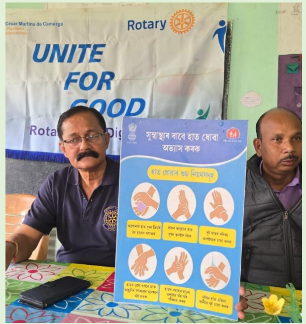
In conjunction with the March Rotary Theme, WASH (Water, Sanitation, and Hygiene), Rotary Club of Digboi organized an Awareness Program on Hand Washing techniques as an initiative to promote hygiene and sanitation among the students. The programme was held at Borjan LP School on 26th March, 2026. The Secretary of Rotary Club of Digboi