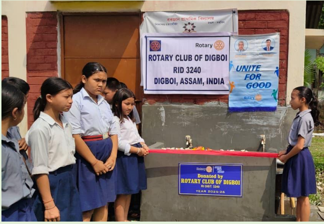
In observance of the March theme of Water, Sanitation and Hygiene (WASH), the Rotary Club of Digboi undertook a meaningful initiative by constructing a concrete wash basin at Borjan LP School.